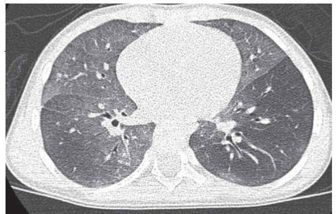
FIGURE 2 Ground-glass opacity in lingular, middle lobe and parahilar areas on inspiratory scan in an infant with persistent tachypnoea of infancy, usual form and biopsy-proven neuroendocrine cell hyperplasia.