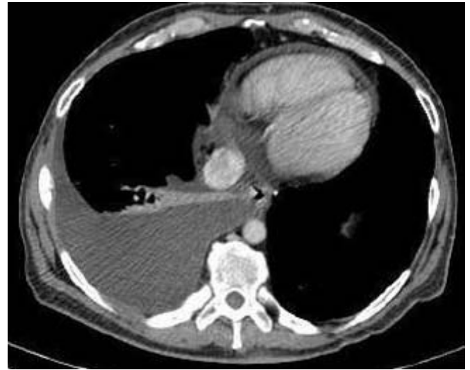
FIGURE 2. A computed tomography scan showing a left pleural effusion with a small pericardial effusion.

Eosinophilic pleural effusion, defined as containing >10\% eosinophils and frequently associated with peripheral eosinophilia, represent 1–9% of all pleural exudates [8]. A cause is