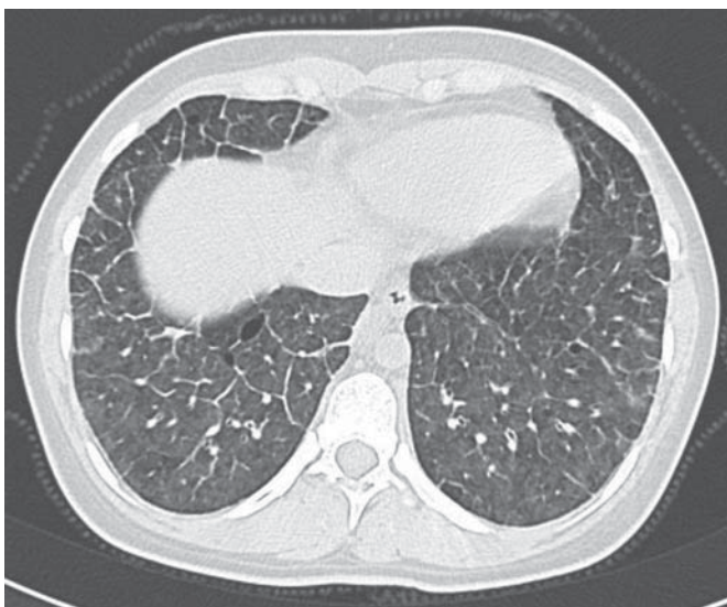
FIGURE 1. High-resolution computed tomography illustrating diffuse ground-glass opacities with thickening interlobular septa.

Right heart catheterisation (RHC) confirmed severe pre-capillary pulmonary hypertension with a reduced cardiac index and reduced systemic and mixed venous oxygen saturation (table 1). Pulmonary wedge pressure was normal. Contrast enhanced computed tomography of the chest excluded chronic thromboembolic pulmonary disease, and high-resolution computed tomography identified diffuse ground-glass opacities with thickening interlobular septa (fig. 1). Bronchoalveolar lavage identified haemosiderin-laden macrophages. Based on